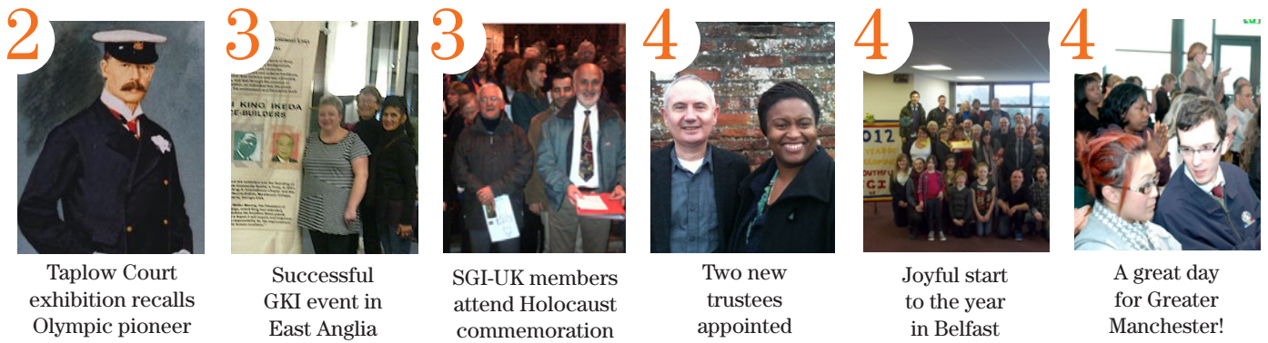
2 Taplow Court exhibition recalls Olympic pioneer